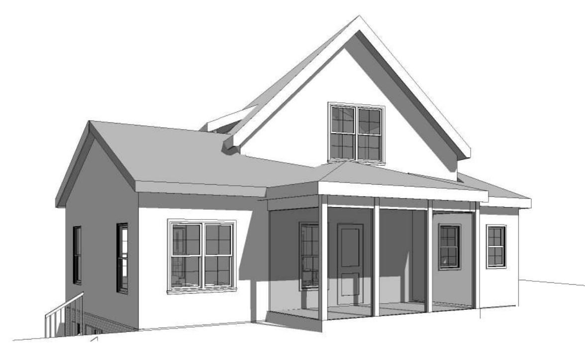
⑥ 3D View 5