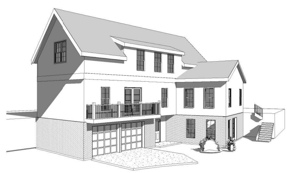
⑤ SOUTH WEST PERSPECTIVE Copy 1